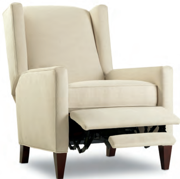
Extended Length: 68 Wall Clearance Required: 17 1/2

Field replaceable arm caps are available in solid hardwood or 3D Thermofoil wrap. Hardwood arm caps are available in standard seating finishes (see hcontractfurniture.com for current options). 3D Thermofoil color options shown below: