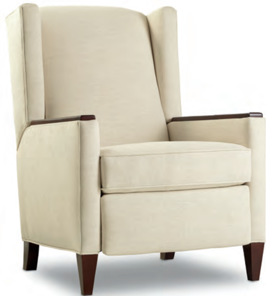
HC9609-R Layne Recliner with Arm Caps Arm Height: 24 3/4 All other dimensions same as HC9608-R

Field replaceable arm caps are available in solid hardwood or 3D Thermofoil wrap. Hardwood arm caps are available in standard seating finishes (see hcontractfurniture.com for current options). 3D Thermofoil color options shown below: